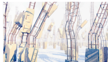
Los Carpinteros: Cabilla cabilla tríptico, 2014 Watercolour on paper 200 x 340.5 cm Private Collection Courtesy of Ivorypress, Madrid © Los Carpinteros